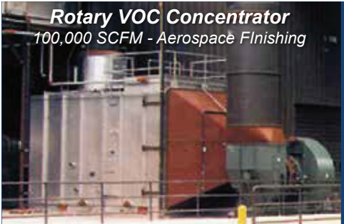
Rotary VOC Concentrator 100,000 SCFM - Aerospace Finishing

High efficiency removal of dilute solvents for high volume VOC air emissions