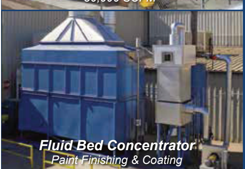
Fluid Bed Concentrator Paint Finishing & Coating