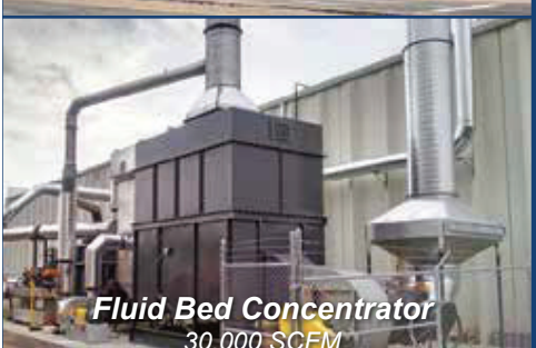
Fluid Bed Concentrator 30,000 SCFM