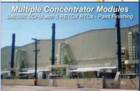
Multiple Concentrator Modules 240,000 SCFM with 5 RETOX RTOs - Paint Finishing